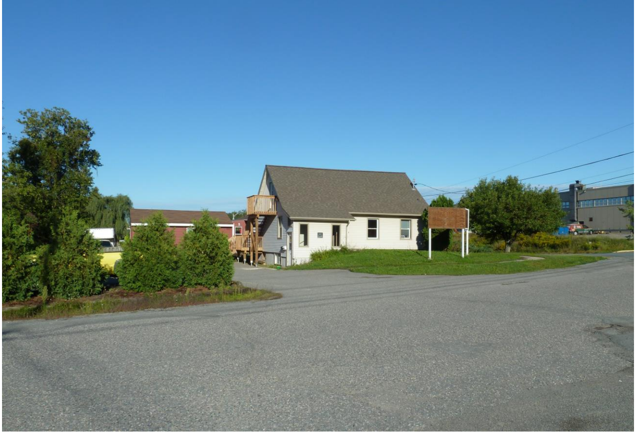
Photo 1: 431 Linda Street, Sudbury View of subject property along easterly corner side yard File 751-6/20-12 Photography Sept 3, 2020