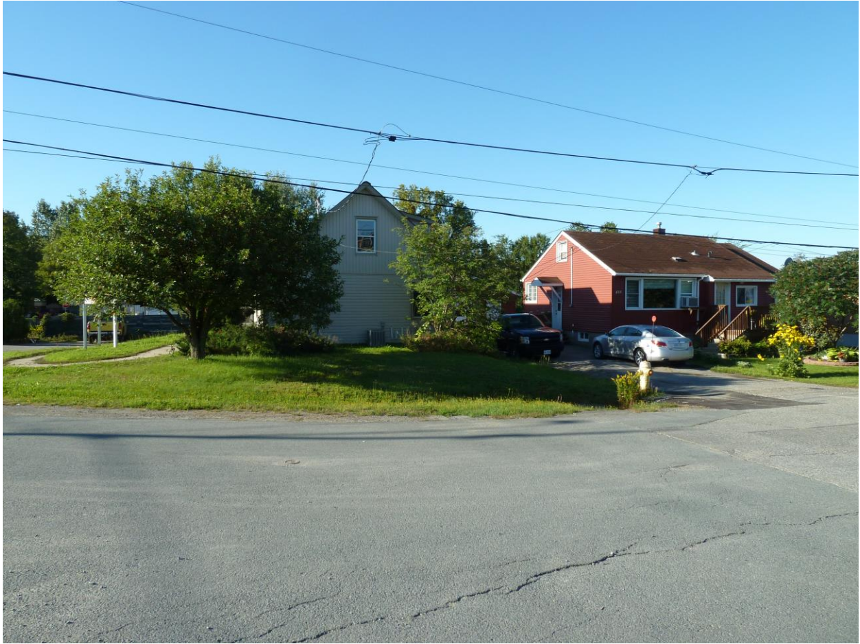
Photo 4: 431 Linda Street, Sudbury Northerly front lot line and single detached dwelling abutting to the west File 751-6/20-12 Photography Sept 3, 2020