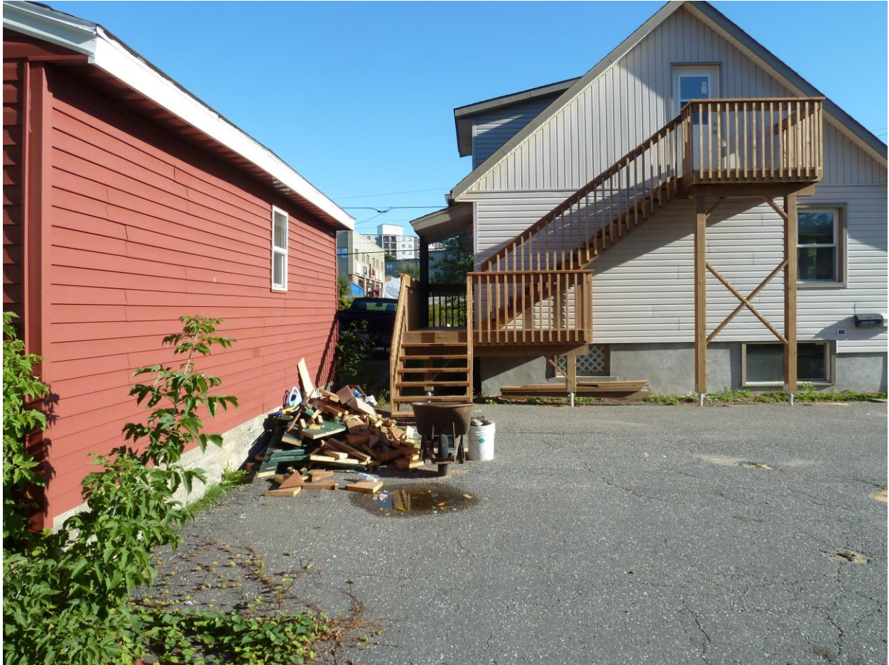
Photo 3: 431 Linda Street, Sudbury Stairs and landings providing access to main floor and second floor units File 751-6/20-12 Photography Sept 3, 2020