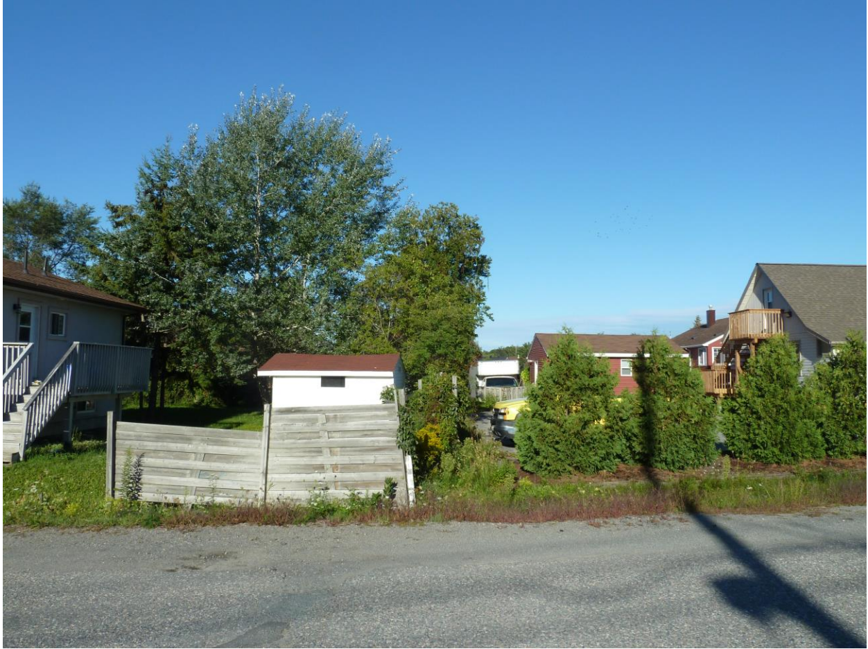
Photo 2: 431 Linda Street, Sudbury Rear property line abutting single detached dwelling to the south File 751-6/20-12 Photography Sept 3, 2020