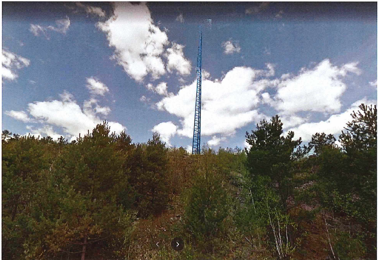
Visual Rendering #2 – 1485 Hannah Lake Road (View From Subject Lands Looking East)