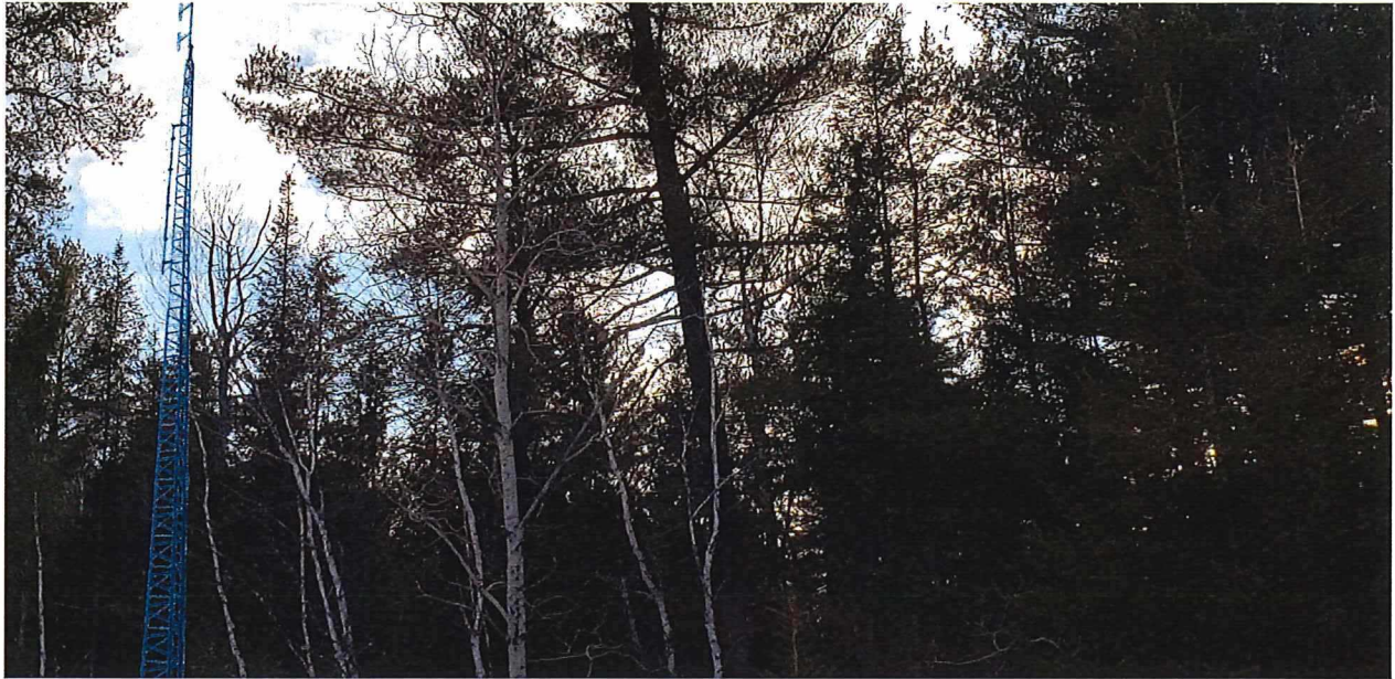
Visual Rendering #1 – 6490 Tilton Lake Road, Sudbury (View From Subject Lands)