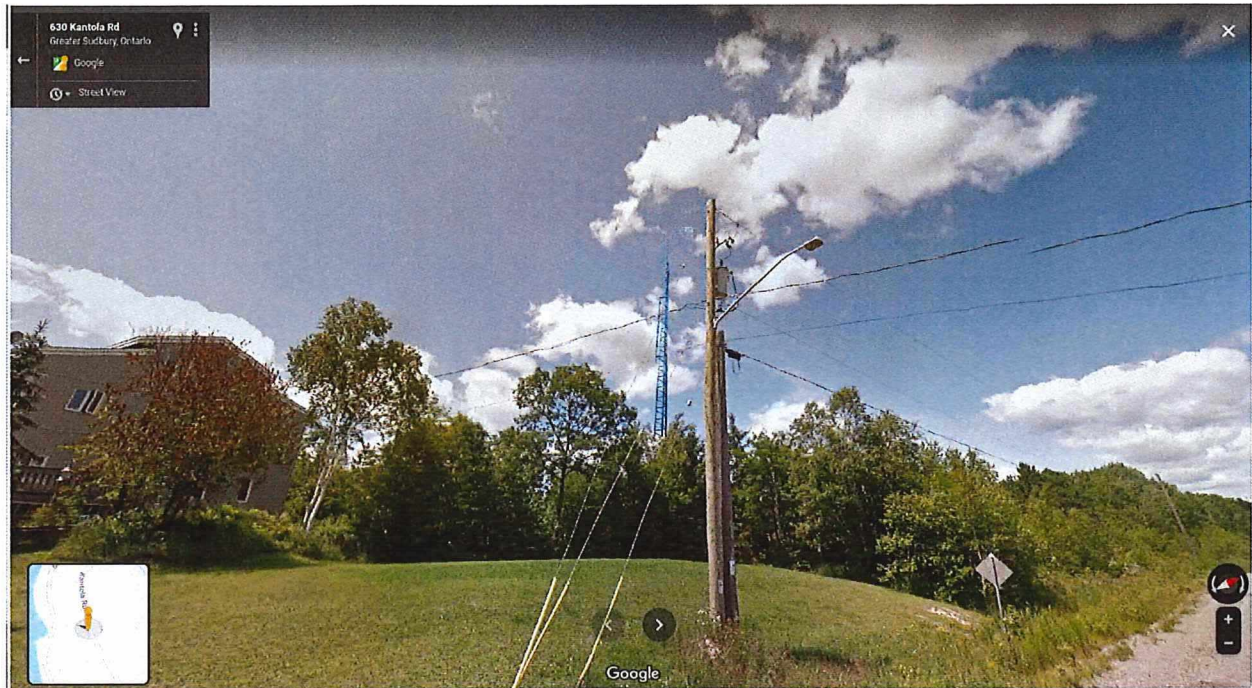
Visual Rendering #3 – 635 Kantola Road, Lively (Looking West From Kantola Rd.)