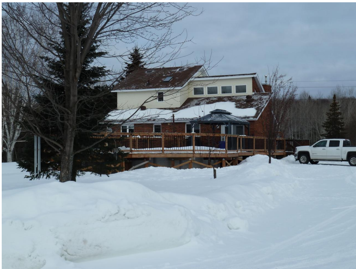
Photo 2: 111 Dominion Drive, Hanmer View of main dwelling File 751-7/20-1 Photography February 5, 2020