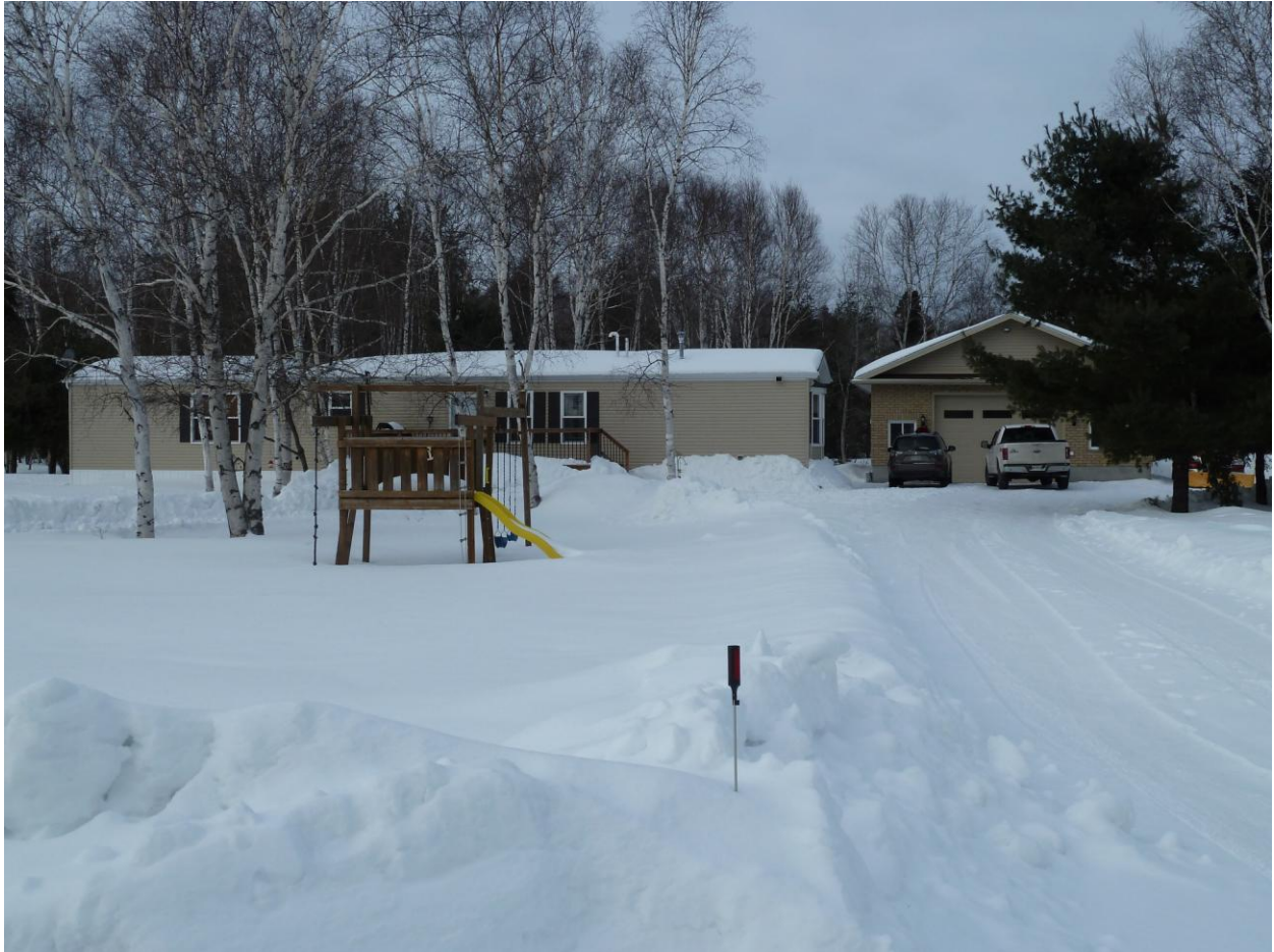
Photo 1: 111 Dominion Drive, Hanmer View of accessory garden suite with detached garage at right File 751-7/20-1 Photography February 5, 2020