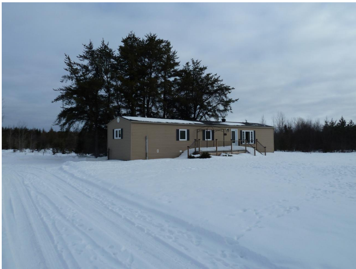
Photo 1: 944 Radar Road, Hanmer View of accessory garden suite behind main dwelling File 751-7/20-2 Photography February 5, 2020