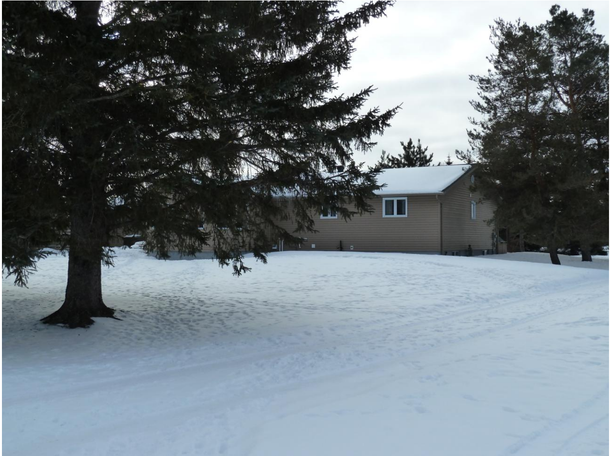
Photo 2: 944 Radar Road, Hanmer View of main dwelling File 751-7/20-2 Photography February 5, 2020