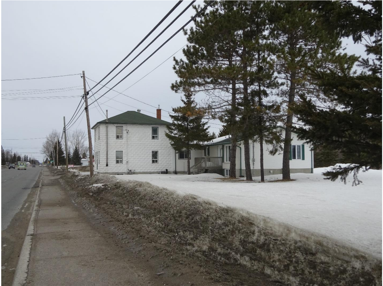
PHOTO #7 – Existing residential dwelling to the immediate west of the subject lands as viewed from Municipal Road #80 looking west.