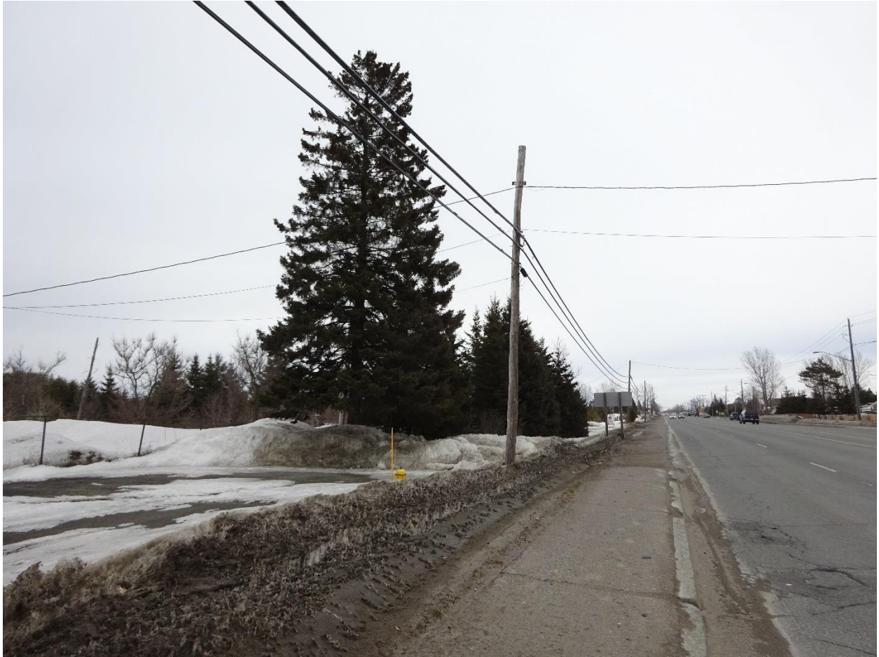
PHOTO #6 – Existing rural lots to the immediate east of the subject lands as viewed from Municipal Road #80 looking east.