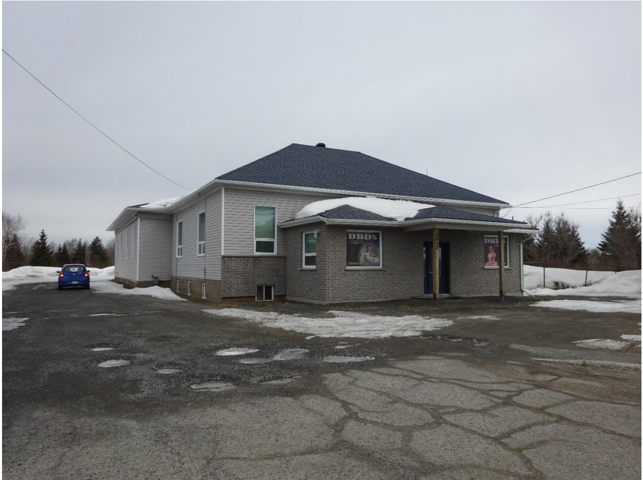
PHOTO #1 – Subject lands with existing building as viewed from Municipal Road #80 looking north.