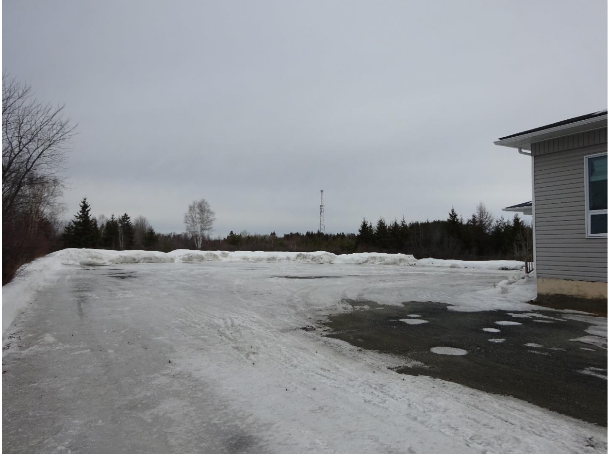
PHOTO #2 – Parking area located in the rear yard of the subject lands as viewed from westerly interior side yard looking north.