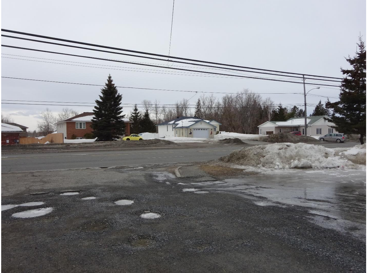
PHOTO #4 – Existing low density residential development as viewed from the subject lands looking south across Municipal Road #80.