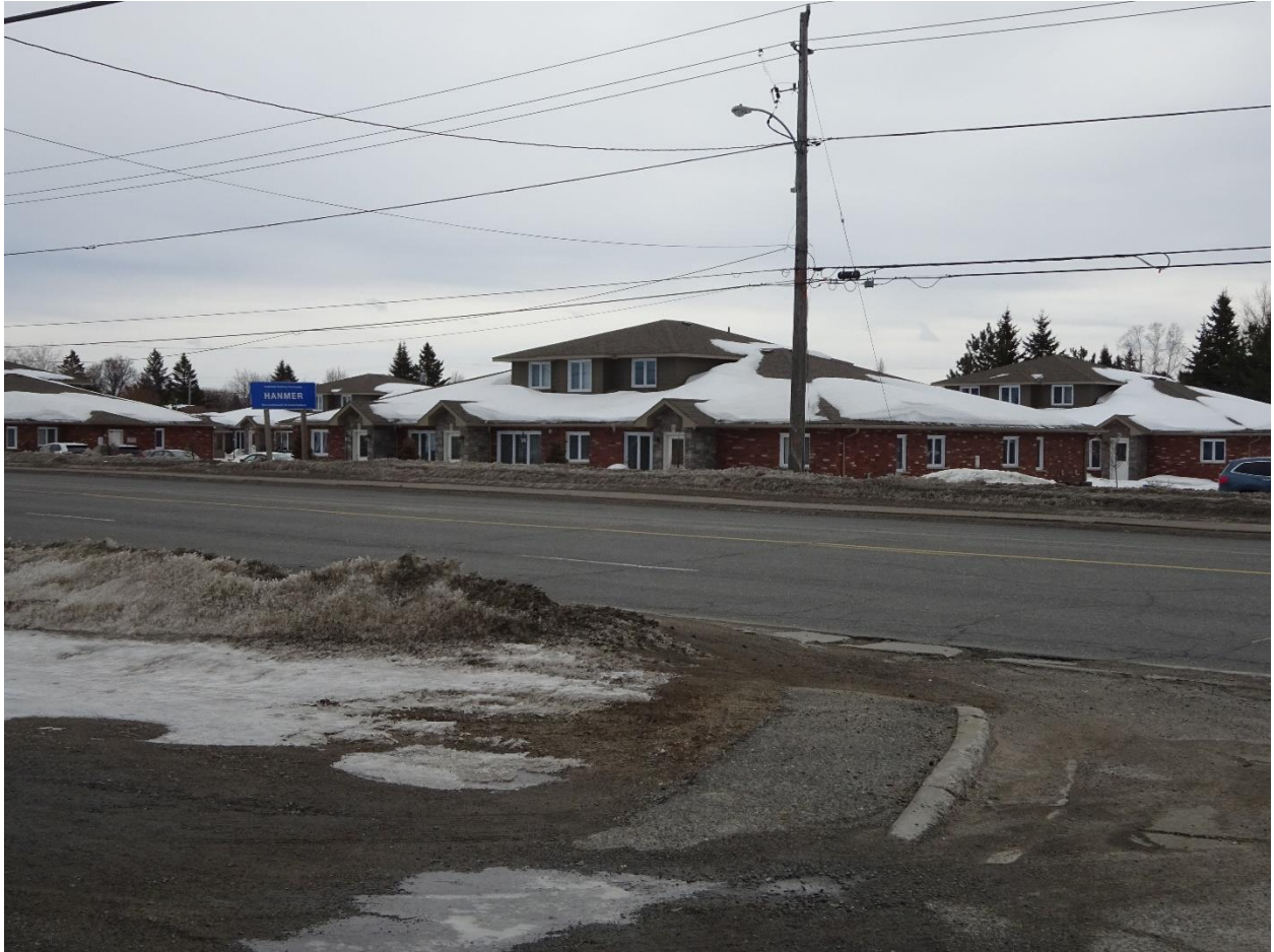
PHOTO #5 – Existing medium density residential development as viewed from the subject lands looking south across Municipal Road #80.