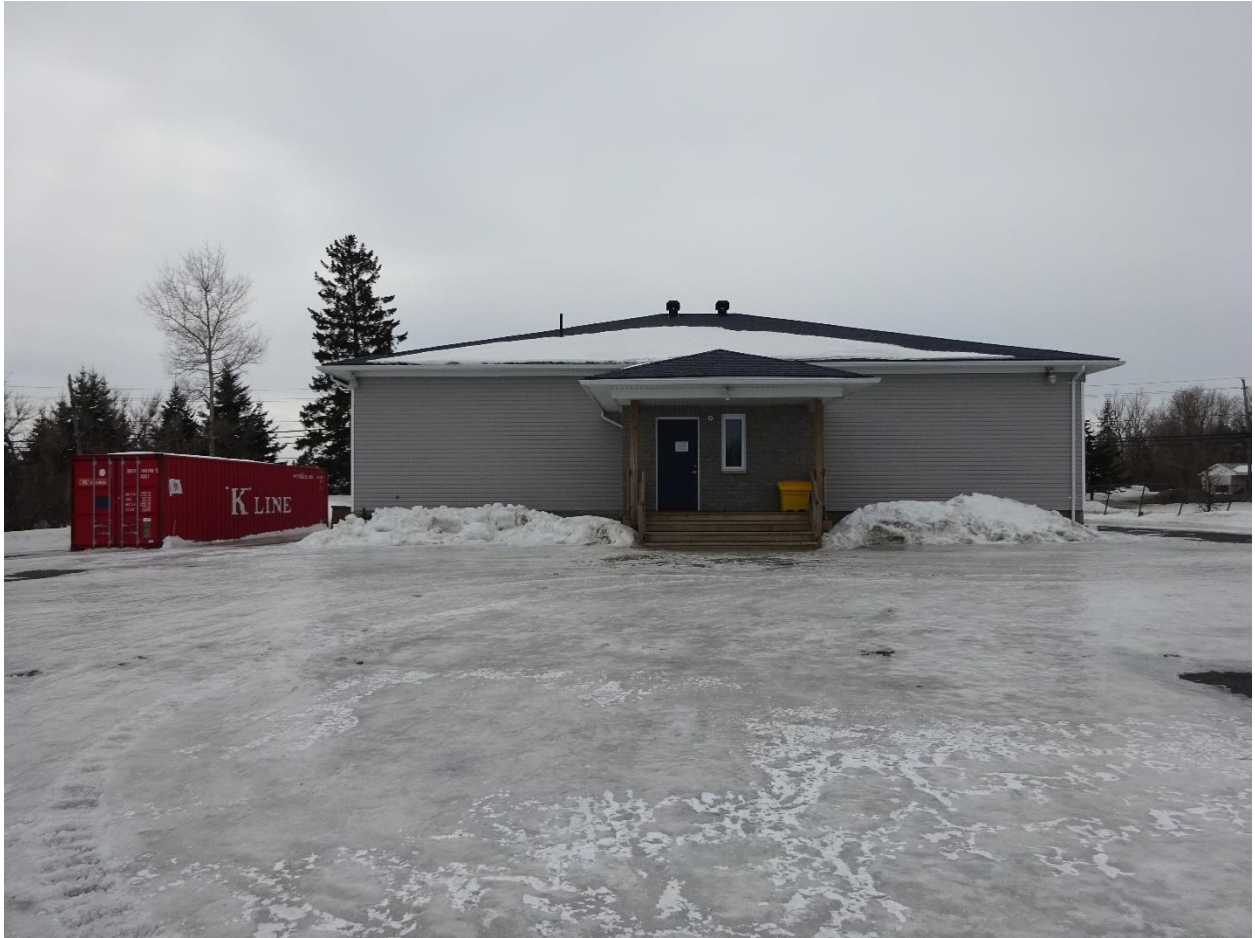
PHOTO #3 – Existing building and shipping container located in the easterly interior side yard as viewed from the rear yard looking south.