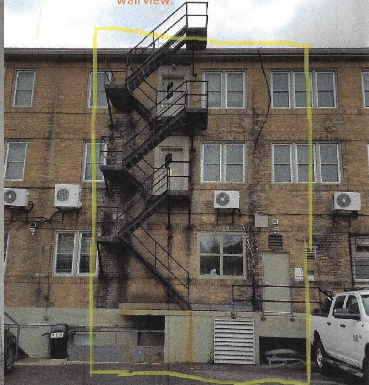
Phase II - Staircase and blackened wall view.

Redesign Canopy with new tear proof fabric or copper covered roof to help symbolize the "Copper" Kettle Guest House. Interior lighting for pleasant night