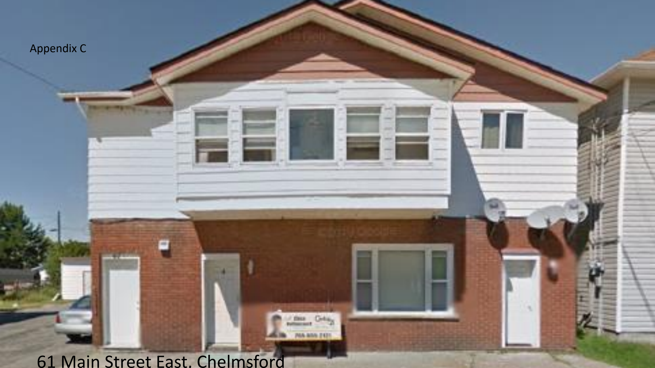
61 Main Street East, Chelmsford