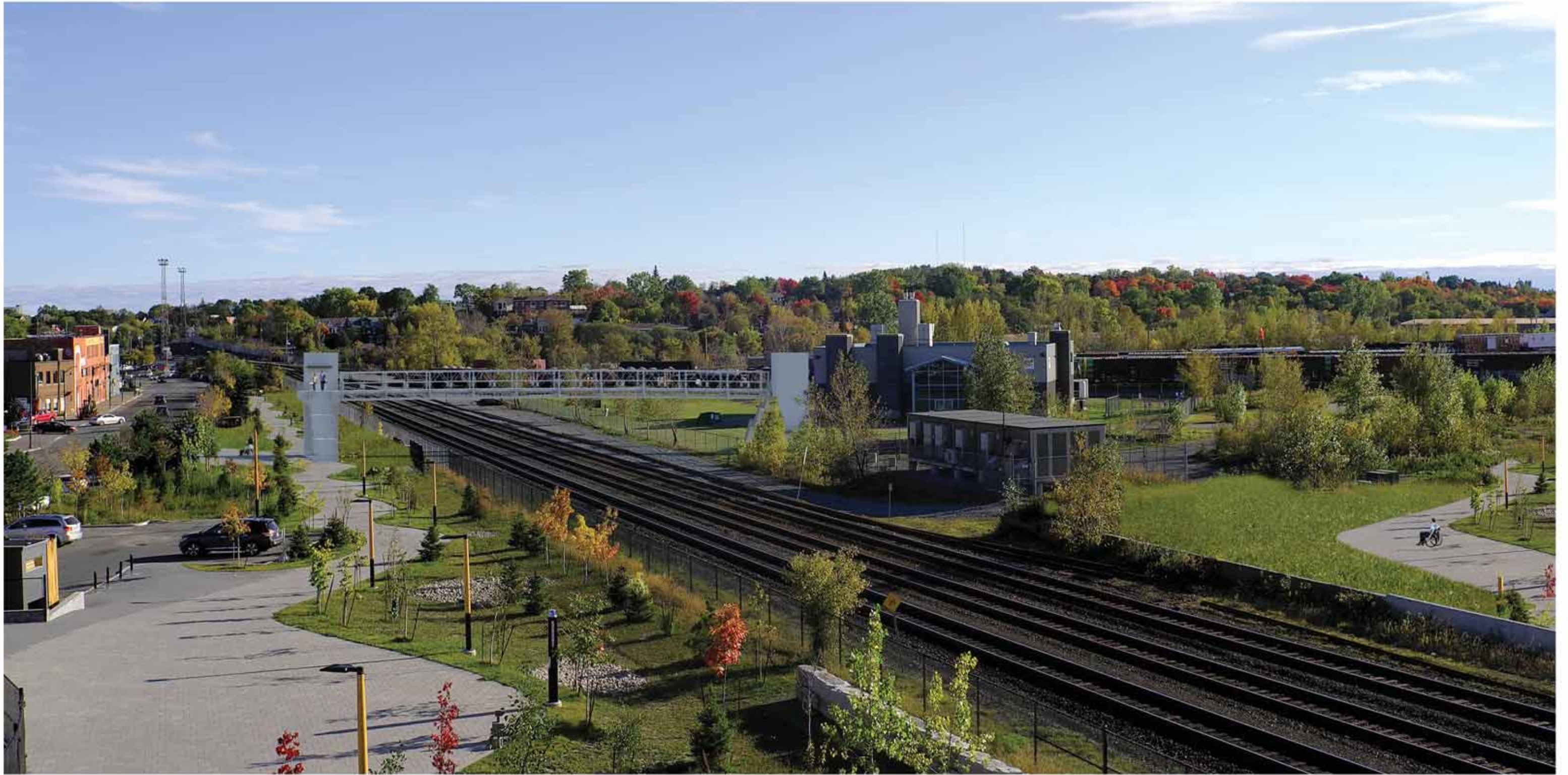
Composite Rendering #1

Option #1A: Standard Pedestrian Bridge with elevators