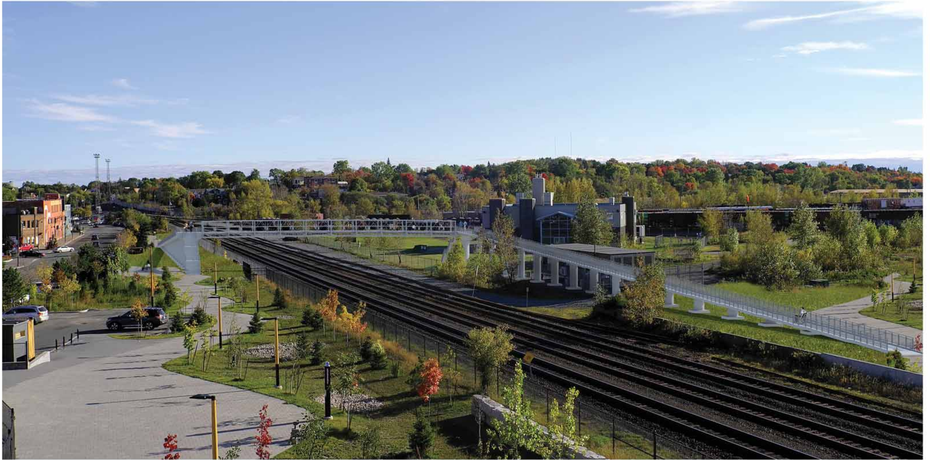
Composite Rendering #1

Option #1: Standard Pedestrian Bridge with ramps