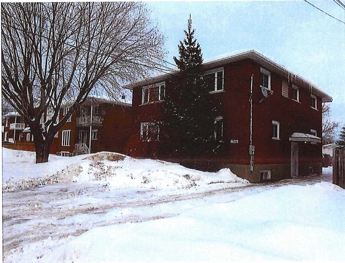
PHOTO #6 – Existing residential buildings to the immediate north of the subject lands as viewed from Paquette Street.