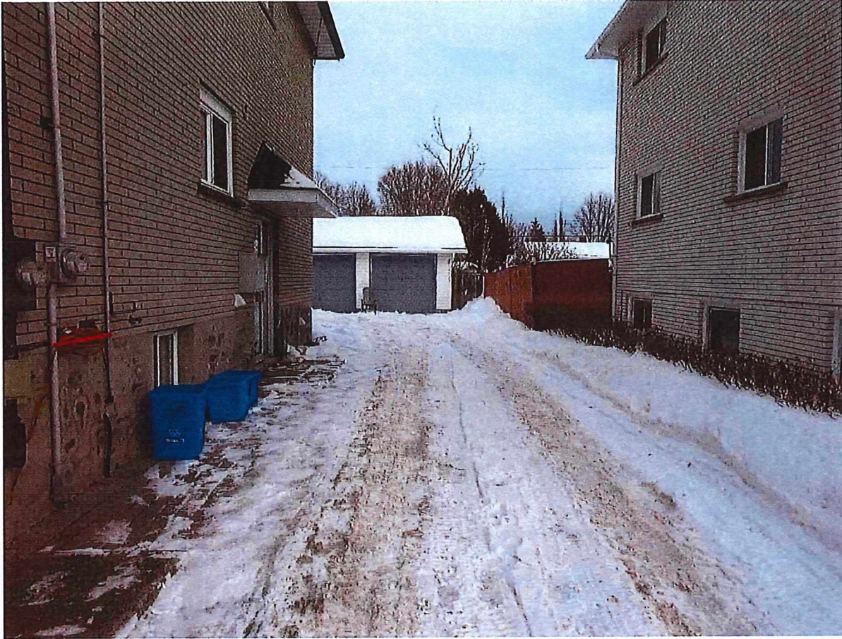
PHOTO #2 – Existing driveway on the subject lands providing access to the rear yard as viewed from Paquette Street looking east.