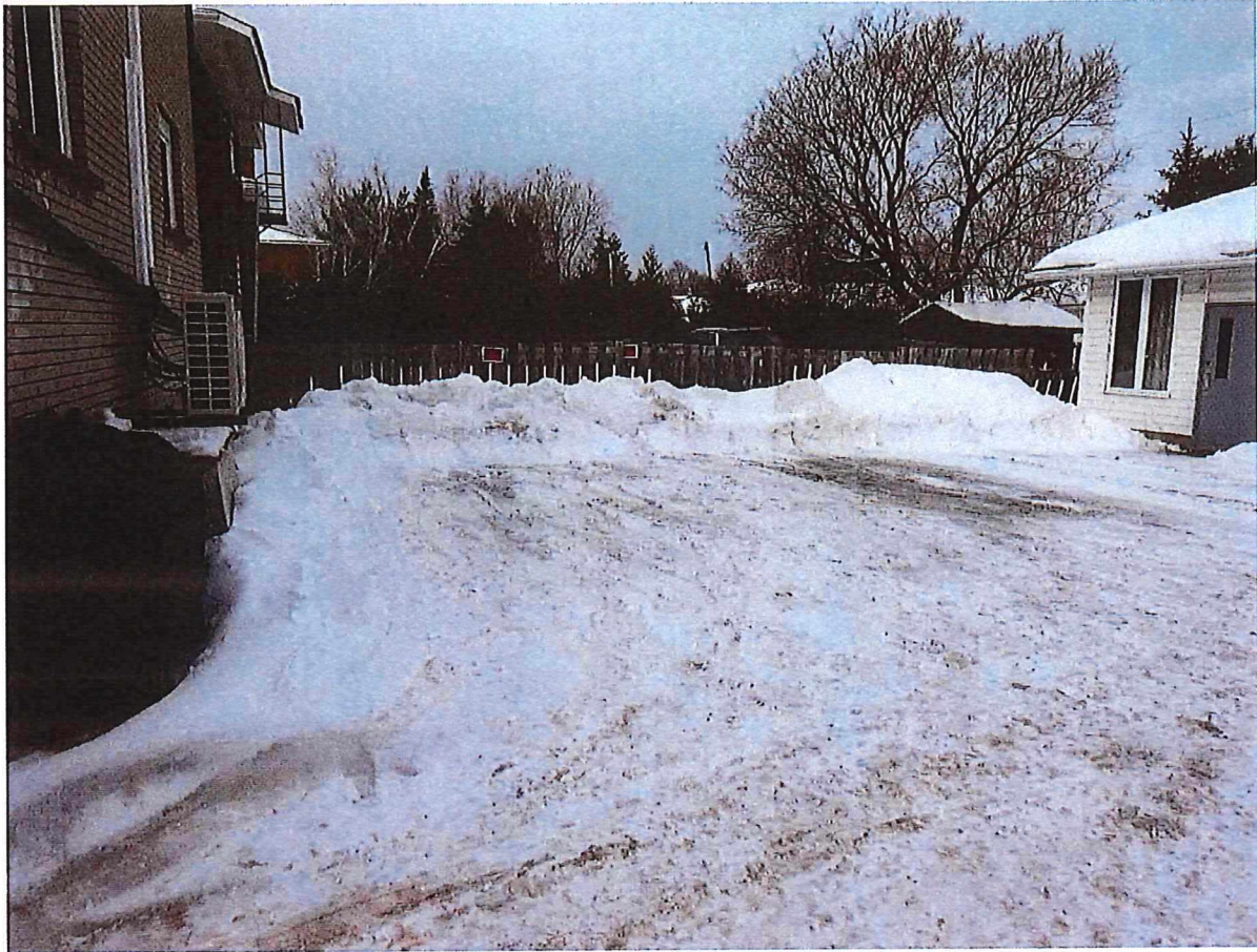
PHOTO #4 – Existing parking area located in the rear yard between the main building and the detached garage on the subject lands.