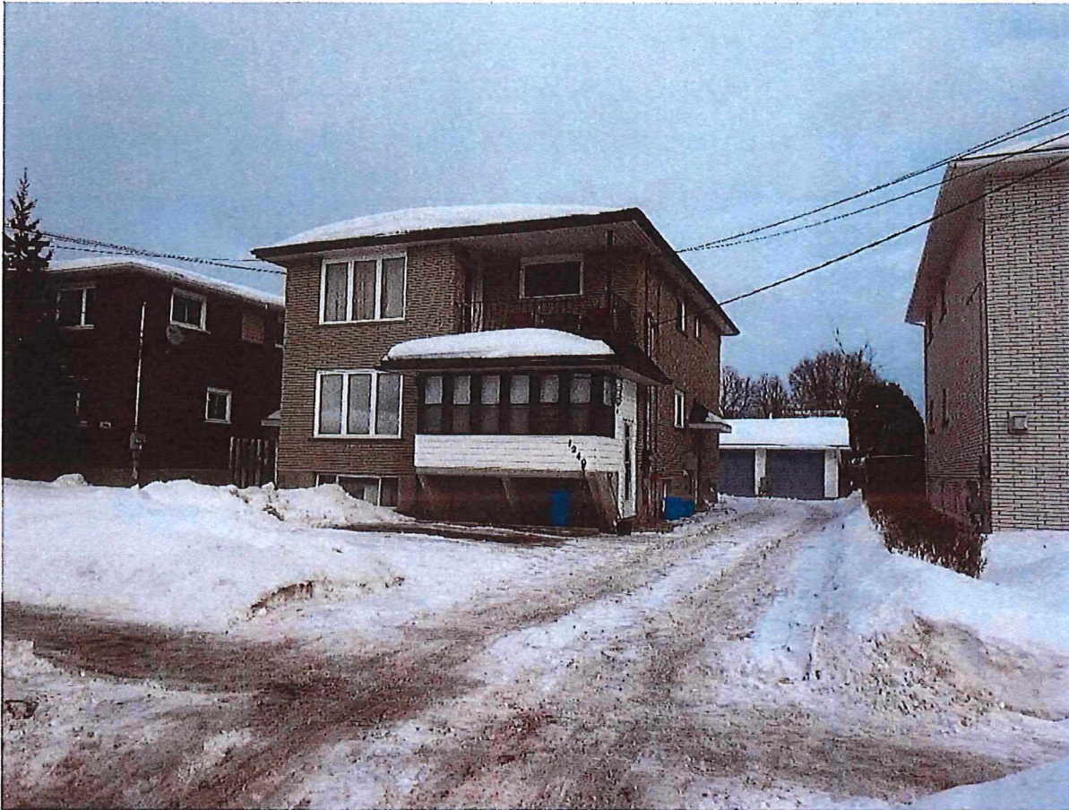
PHOTO #1 – Subject lands containing a multiple dwelling with four residential dwelling units as viewed from Paquette Street looking east.