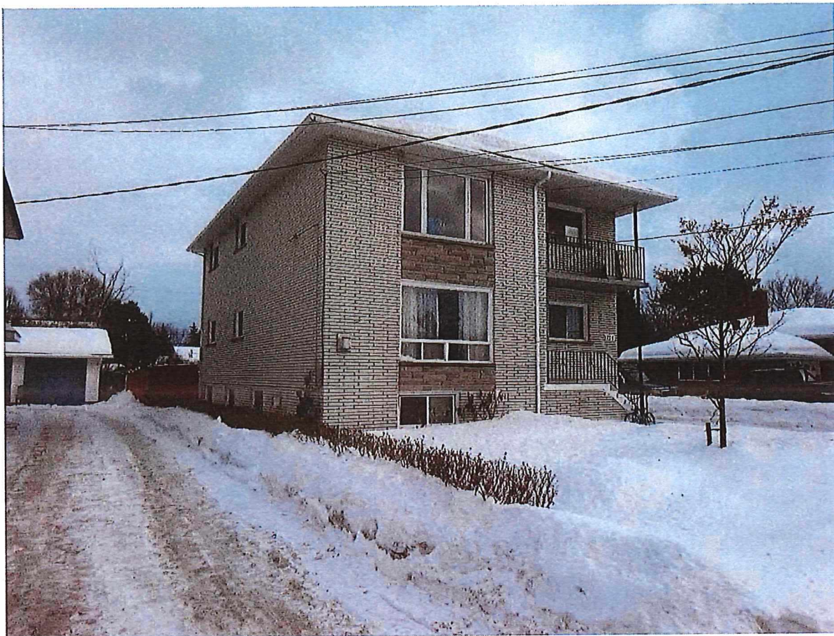
PHOTO #5 – Existing residential building located to the immediate south of the subject lands as viewed from Paquette Street.