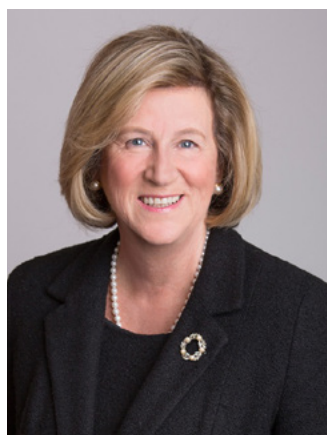
Dr. Helena Jaczek