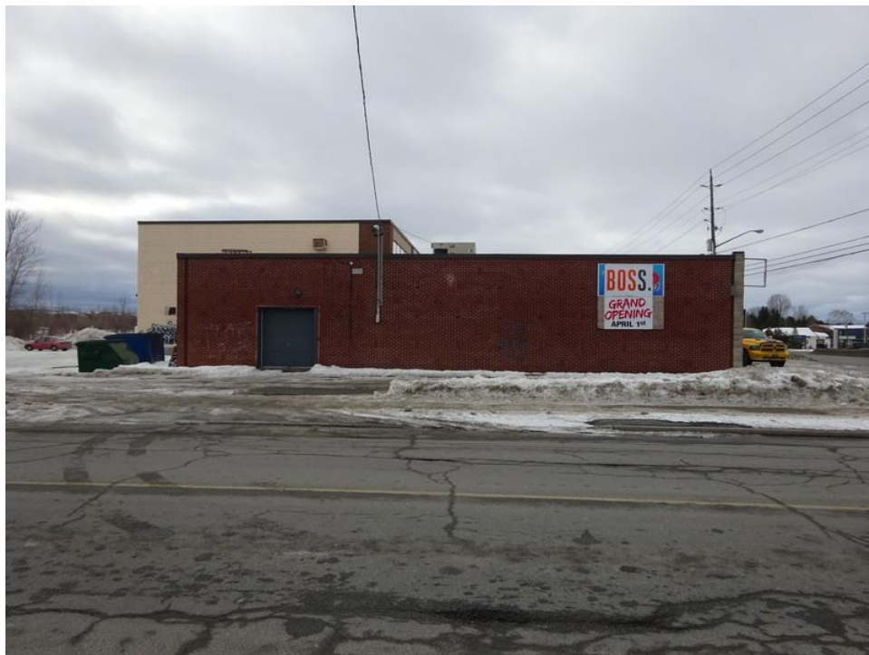
PHOTO 2 SUBJECT LANDS WITH PARKING, LOADING AND REFUSE STORAGE VISIBLE AS VIEWED FROM AUGER AVENUE LOOKING WEST