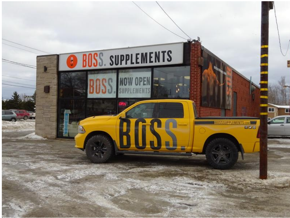
PHOTO 1 SUBJECT LANDS CONTAINING EXISTING RETAIL STORE AS VIEWED FROM LASALLE BOULEVARD LOOKING SOUTH