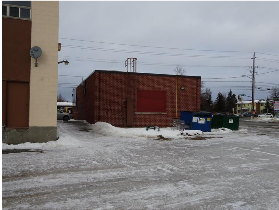
PHOTO 3 EXISTING REFUSE STORAGE AREA IN THE REAR YARD AS VIEWED FROM ABUTTING LANDS TO THE WEST