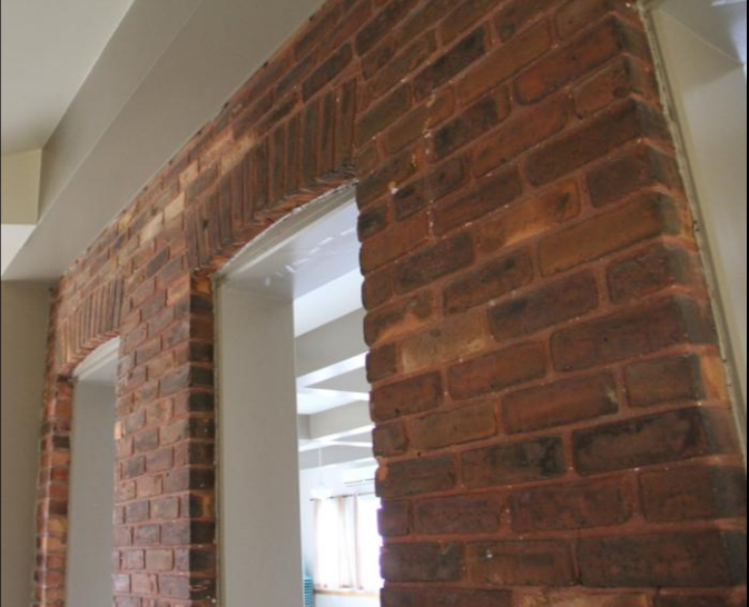
Internal Detail in 2016. Original exterior seen from within new addition.