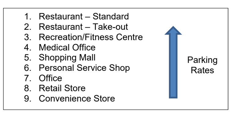
Figure 1: Relationship between parking rates and commercial use

With a few exceptions, Sudbury has generally applied the same parking rate (i.e. 5 per 100 sqm (or 1 per 20 sqm, as written in the By-law) of net floor space) for different commercial uses. In fact, 1 per 20 sqm is the rate applied generally in the Sudbury By-law for unspecified uses. There appears to be a trend for providing differential parking rates based on the type of commercial use amongst these municipalities. Generally the highest parking rate requirement is for a standard restaurant with a convenience store ranking last. See Figure 1.