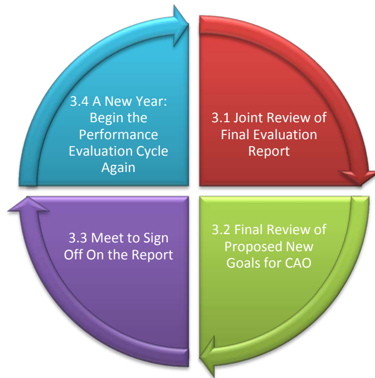
Figure 4: Annual CAMA Performance Evaluation Cycle, Part 3

3.1: Joint Review of the Final Performance Evaluation Report – The conversation presents and discusses the Final Performance Evaluation Report . The templates offer tips about providing constructive feedback. Discussion revolves around the key elements of the Toolkit.